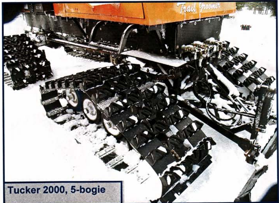
Tucker 2000, 5-bogie

WHO is Hans Hall Inc. ? Hans Hall is the only company that offers complete track systems and spare parts for almost all groomer makes and models. We offer Steel, Aluminum and Rubber systems in both OEM and Hans Hall designed tracks.